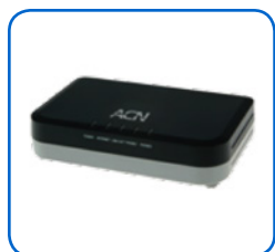
ACN Phone Adapter